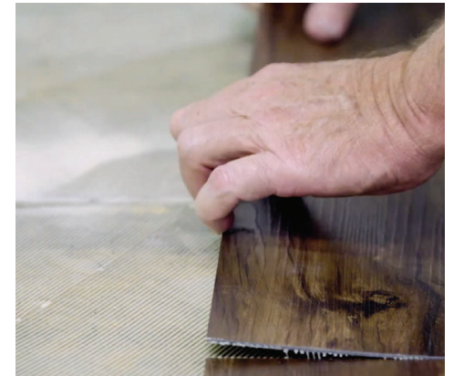
Install LVT into adhesive