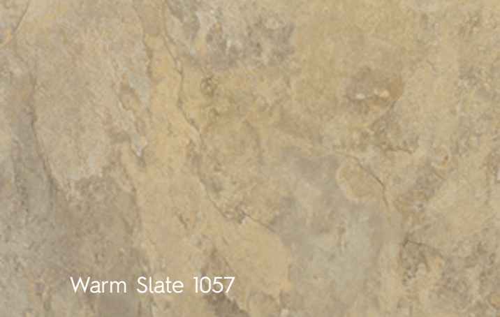
Warm Slate 1057