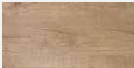
BEACH HOUSE 8121 MAIN ST