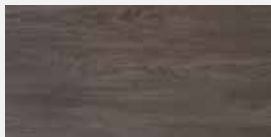
MIDNIGHT GREY 7030 LEVEL 7