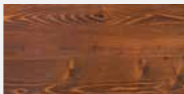
SUNRISE 7010 LEVEL 7