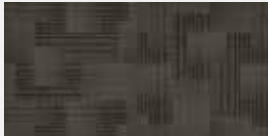
ABBEY RD 001-02 MODULAR CARPET