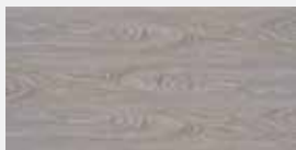
STONEY MOUNTAIN 7099 LEVEL 7