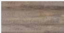
ALAMO 8138 MAIN ST