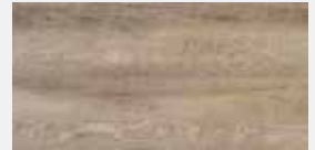
CHEYENNE 9553 GOLD