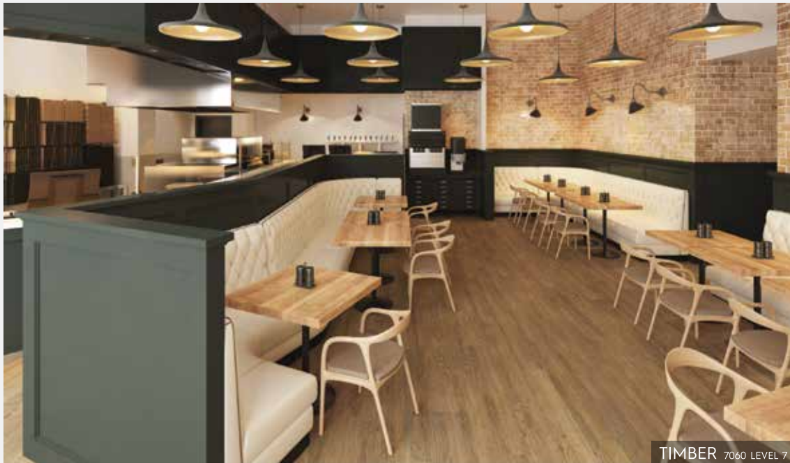
TIMBER 7060 LEVEL 7