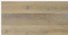
YOSEMITE 8399 MAIN ST