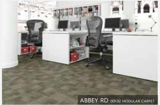
ABBEY RD 001-02 MODULAR CARPET