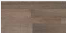
UNION RIDGE 8655 CITY HT