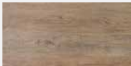
TIMBER 7060 LEVEL 7