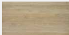
CRYSTAL COVE 8659 CITY HT