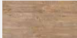
SIERRA 9260 SILVER