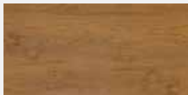
VINEYARD 8114 MAIN ST