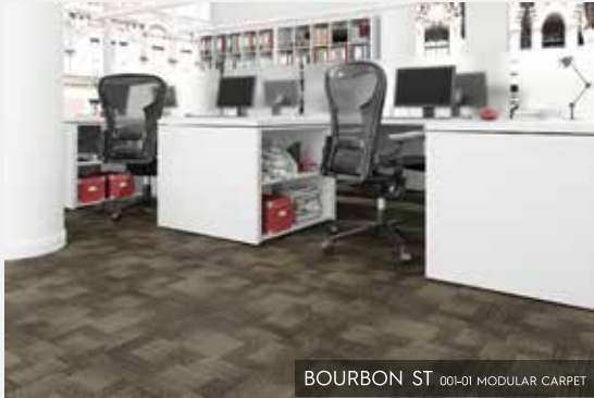
BOURBON ST 001-01 MODULAR CARPET