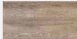
CHEYENNE 8153 MAIN ST