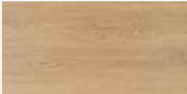
NAVAJO 9563 GOLD