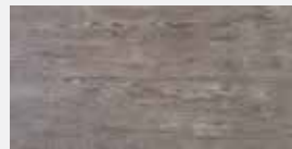
SHADOW 8076 MAIN ST