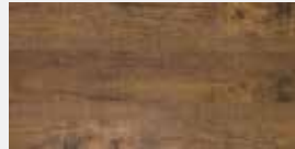
BARN OWL 9522 GOLD