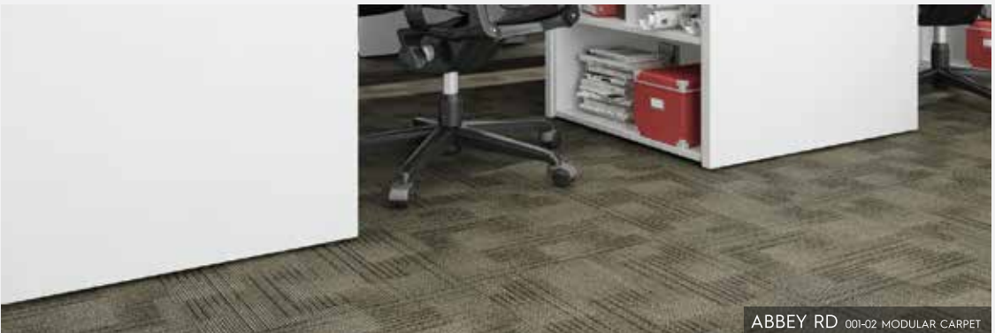
ABBEY RD 001-02 MODULAR CARPET