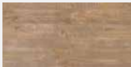
SIERRA 8060 MAIN ST