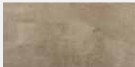
ADOBE 1110 TOWNSQUARE