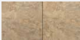
GENUINE CERAMIC 1783 TOWNSQUARE