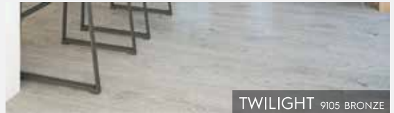
TWILIGHT 9105 BRONZE