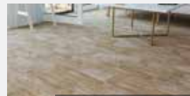
SIERRA 8060 MAIN ST