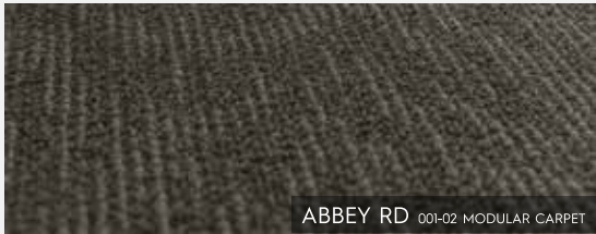
ABBEY RD 001-02 MODULAR CARPET