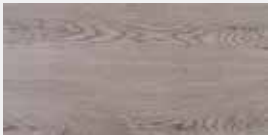
STORMY SKY 9157 BRONZE