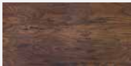
DARK WALNUT 8131 MAIN ST