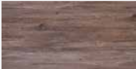
ASH 9507 GOLD