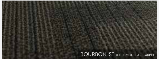
BOURBON ST 001-01 MODULAR CARPET