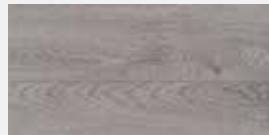
TWILIGHT 9105 BRONZE