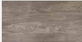
LA JOLLA 9516 GOLD