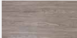
MIDLAND GREY 9225 SILVER