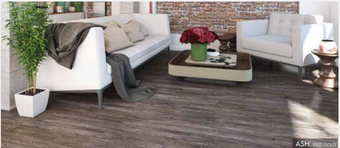
ASH 9507 GOLD