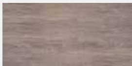
ROCKPORT 7095 LEVEL 7