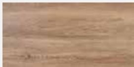
SPOKANE 8182 MAIN ST