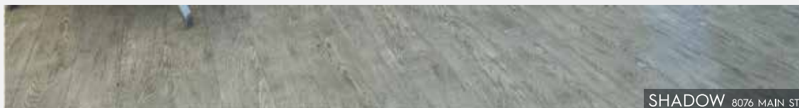
SHADOW 8076 MAIN ST